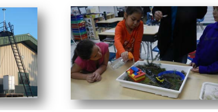
Oshki Oqimaaq students learn about soil and water run-off

The Air Program is very passionate about motivating young community members to get excited about science and natural resources and to enter into a career in natural resource management. We teach weekly lesson plans to K-6<sup>th</sup> grades at the Oshki Ogimaag Charter School with topics ranging from wild rice seeding to moose and wolf capture and collaring.