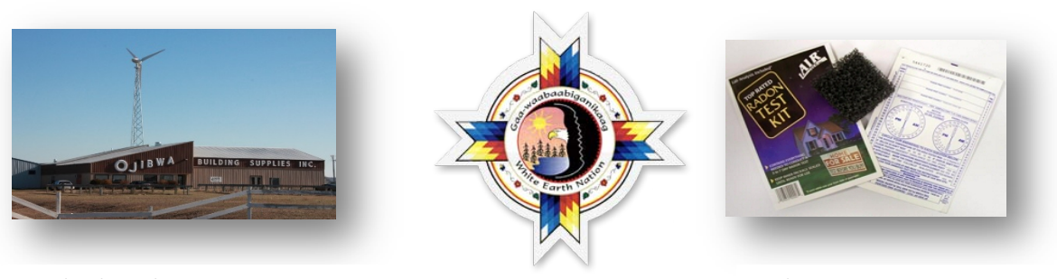
Wind turbine alternative energy

Also, the White Earth Department of Natural Resources has currently distributed five hundred radon test kits throughout the White Earth Reservation through outreach events with the community, as well as the Housing and Head Start departments.