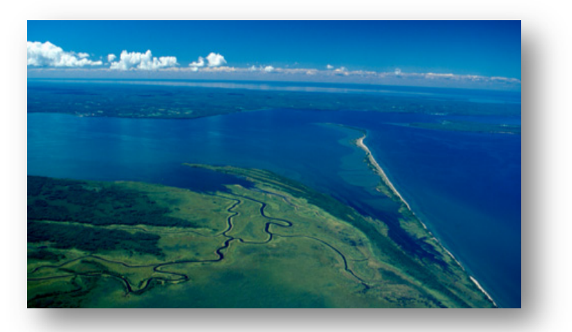
Bad River Reservation: Kakagon Sloughs, Chequamegon Bay, and Long Island

More information on Bad River's Class I and air quality program: http://x.co/BRair