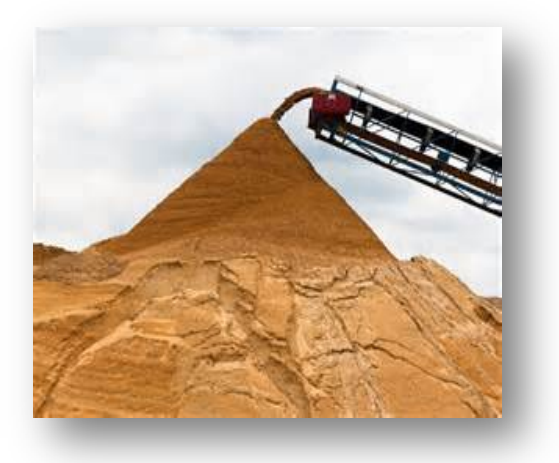
Frac Sand Mine Operation in Wisconsin

The Ho-Chunk Nation has also become aware of air quality concerns related to the frac sand industry as the Nation has numerous Tribal Members that now live within a mile or less of large Frac Sand Mines. The Ho-Chunk Nation has partnered with the Institute for Wisconsin's Health Inc. and numerous counties within Western Wisconsin to complete a Health Impact Assessment (HIA) on Industrial Sand Mining. A HIA will provide the information necessary for local and state government to make informed decisions to ensure that public health is protected. The HIA Project is scheduled to be completed in April 2016. Little research has been completed in evaluating the impacts of a single frac sand mind let alone the cumulative impacts multiple mines in a localized area. The HIA will evaluate all aspects of the mine from economics to environmental to cultural/social to determine the actual impact on community health.