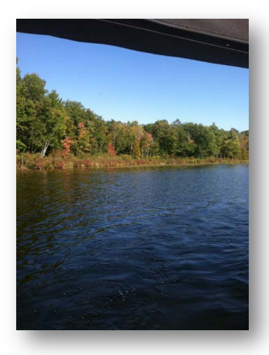
Looking for stands of wild rice and/or potential areas for restoration on Vaughn Lake, near Glennie Michigan.

The Saginaw Chippewa Indian Tribe of Michigan is looking forward to building capacity in their Air Program.