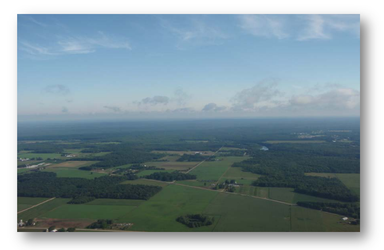
The southern part of the Reservation. Observations have been hazier than usual.

The Stockbridge-Munsee Tribe currently does not have a formal air program funded by specific air grants. The Tribal Council is currently considering investigating the process of designation of our airshed to Class 1. Intensive agricultural and continued industrial development within 50 miles of the Reservation are a concern to the Tribe. We also include indoor air quality (IAQ) assistance and investigations within the scope of activities to Tribal Members and Tribal governmental buildings. This includes investigations on mold, asbestos and radon within homes and governmental buildings and is done on an as-requested basis or where a problem is suspected. This activity is funded through a combination of EPA General Assistance Program (GAP) funding and Tribal funding. We have not received any complaints about outdoor wood boilers, however we would like to get ahead of that issue and propose changes and updates to the Tribal law, chapter 35, Air Pollution Control, before this becomes an issue.