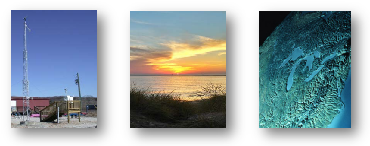
Working to improve air quality for our Tribe, our community and our world.