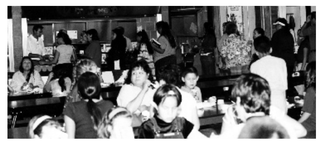
Enjoying the Fun Night Meal