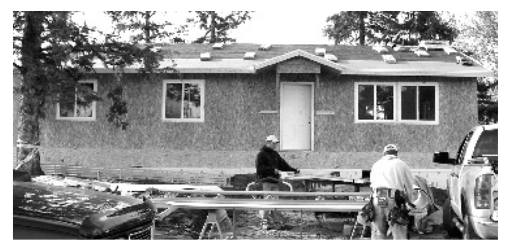
100 Homes / Page 3 Model home currently under construction.

Those three requirements are: 1) you must be an enrolled member With that in mind, the of the Leech Lake Reservation; 2)