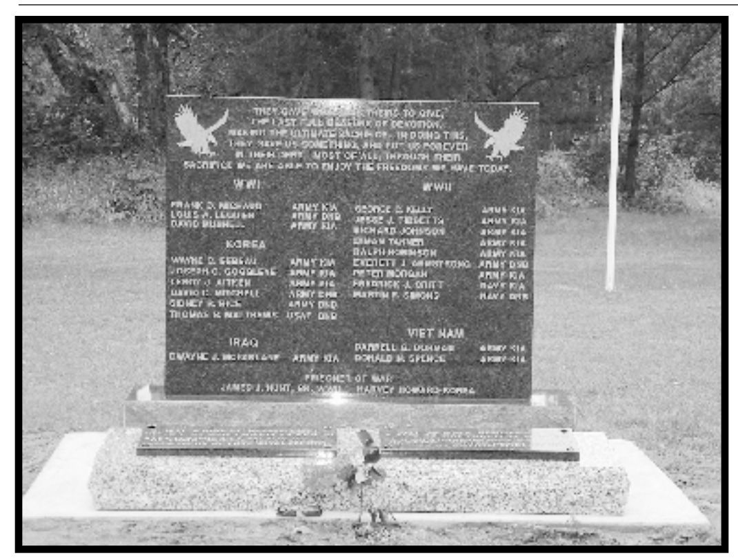
Pictured above is the veterans memorial monument that is located at the south entrance of the Veterans' Memorial Grounds near the Bingo Palace and Casino in Cass Lake, Minnesota