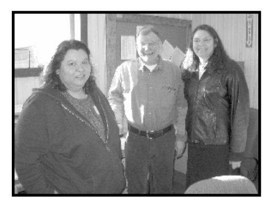
Trio of visitors visit Nigaane Immersion Program.