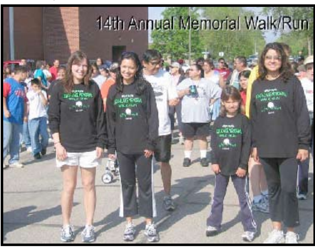
Pictured above in the black shirts is the Fitness Team ready to start out the Memorial Walk/Run.

The 14th Annual Leech Lake Memorial Walk/Run was held on May 25, 2006. The event is held in honor and in memory of all loved ones that have passed on. Everyone is invited to participate. Make plans now to attend next year's event!