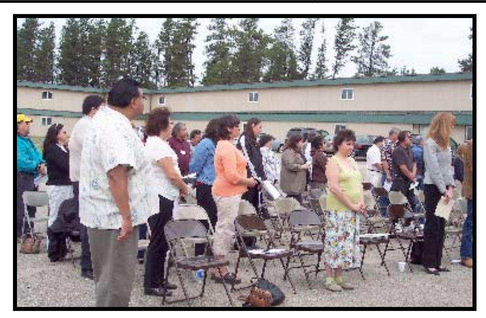
Audience gathers outside the Leech Lake ENP site for Achievement Center Grand Opening in Cass Lake.