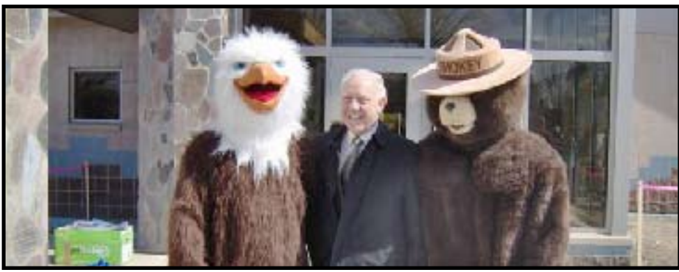
Smokey the Bear and the Bald Eagle join Congressman Jim Oberstar at the Grand Opening of the Welcome Center.

The new facility is the result of a collaborative effort between the MIRACLE GROUP, the Leech Lake Band of Ojibwe, the City of Cass Lake, the Chamber of Commerce, Pike Bay Township, the U.S. Forest Service and MN Dot. The building houses a Tourism office that will assist travelers with information about the area and other pertinent information they may be seeking. Stop by and take a look.