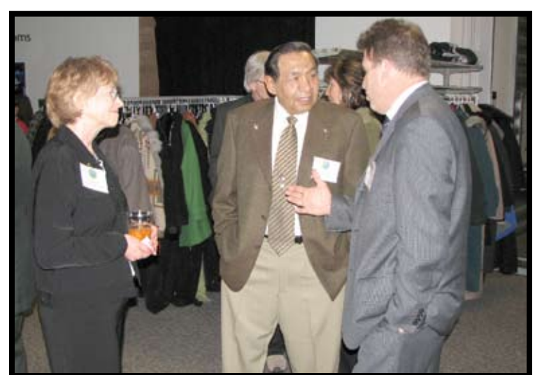
Held at the Science Museum of St. Paul, Mn. on February 19, 2008