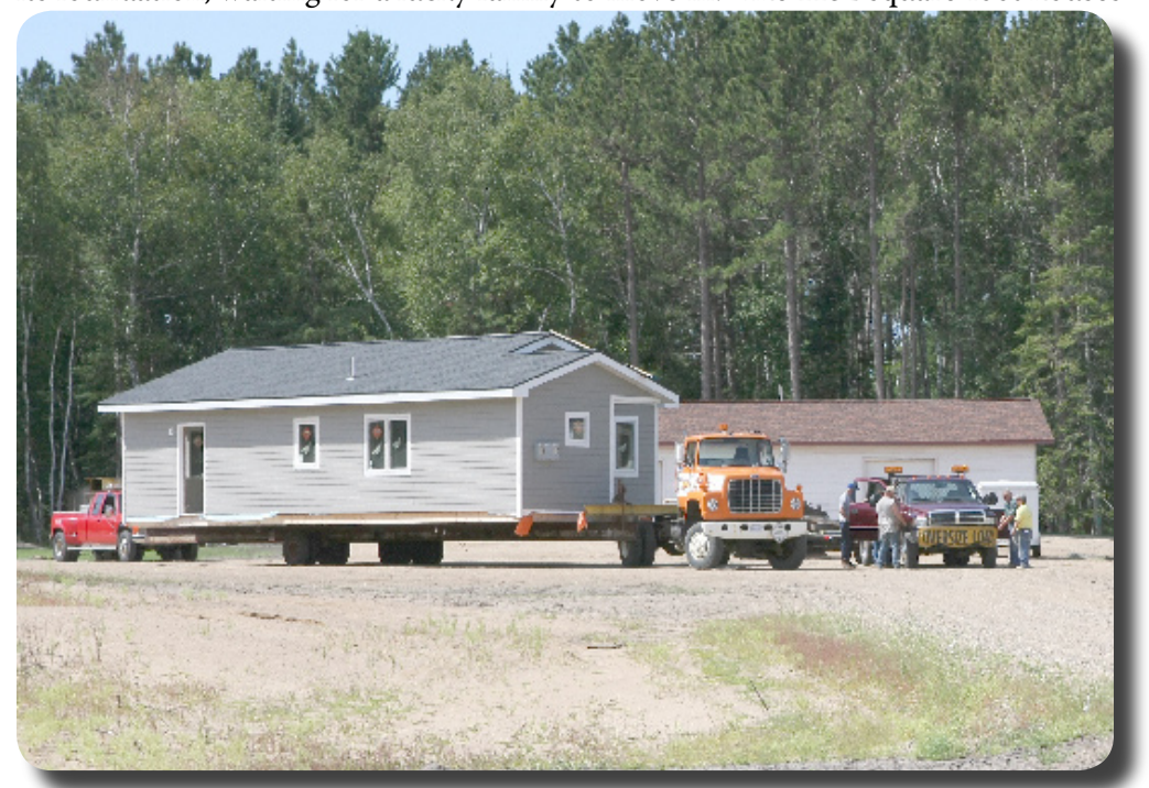
This home was built by Leech Lake Tribal College students and was moved to Red Lake ready for some lucky family to move right in.

Two new houses built by Leech Lake Tribal College students have been transported to the Red Lake Reservation, helping the Red Lake Nation meet its need for affordable housing. One of them is already home to a family, and the other is on its foundation, waiting for a lucky family to move in. The 1152 square-foot houses