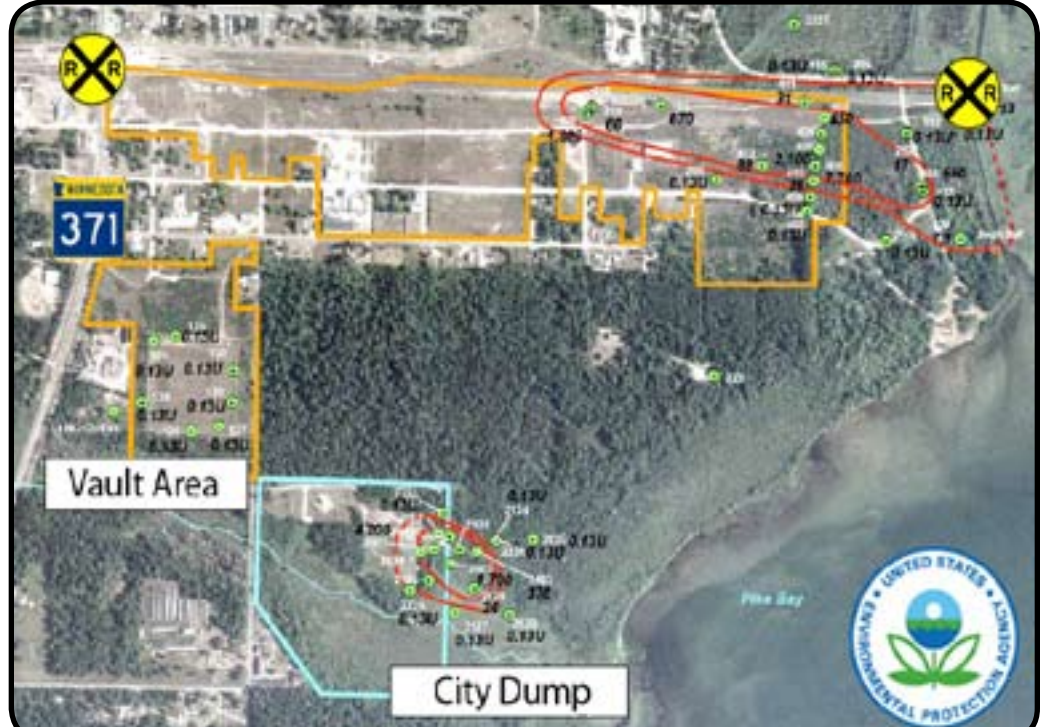
Aerial Photo showing Superfund Site Operations Area in yellow and surounding areas. Photo taken from EPA Site Activities Update

First and foremost I would like to thank many of the Band members who have commented on how much you have enjoyed and appreciate reading my articles and reports. Some of the Band members have asked me who writes my reports, well I am pleased to tell you that I do all of my own writing. Writing is a skill that I acquired over the years as a former administrator and something that I enjoy doing. Unfortunately sometimes it's difficult to find the time with all of the other duties associated with the office of Secretary Treasurer but I do try my best to keep all of our Band members as well informed as possible. As I have always said it is your Reservation and as Band members you have the right to know.