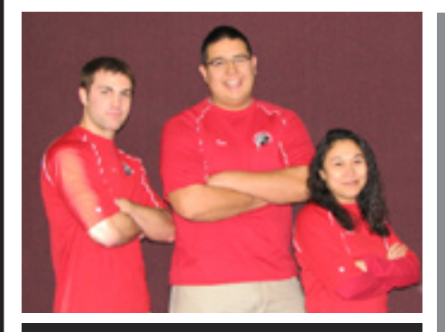
Sponsored by: Leech Lake Diabetes Fitness Program

All miles must be supervised and/or signed off by Leech Lake Fitness Staff or delegated personal. You must be registered as member of the Leech Lake Fitness Program to participate!!