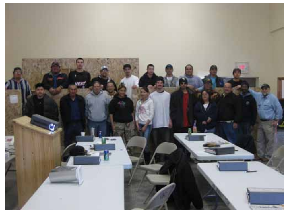
Weather tech grads pose for a photo after completing the Weatherization Training at the Prescott Community Center.

Tribal Development has worked with District Representative Steve White in obtaining this grant specifically for the Sugar Point community. This community is in a rural part of the Leech Lake Reservation, and the new community center will provide needed building capacity for future growth which will be accomplished by the new structure being built and by using the current community center at Sugar Point for other needs such as Elderly Nutrition Program, health clinic, training facility, etc.