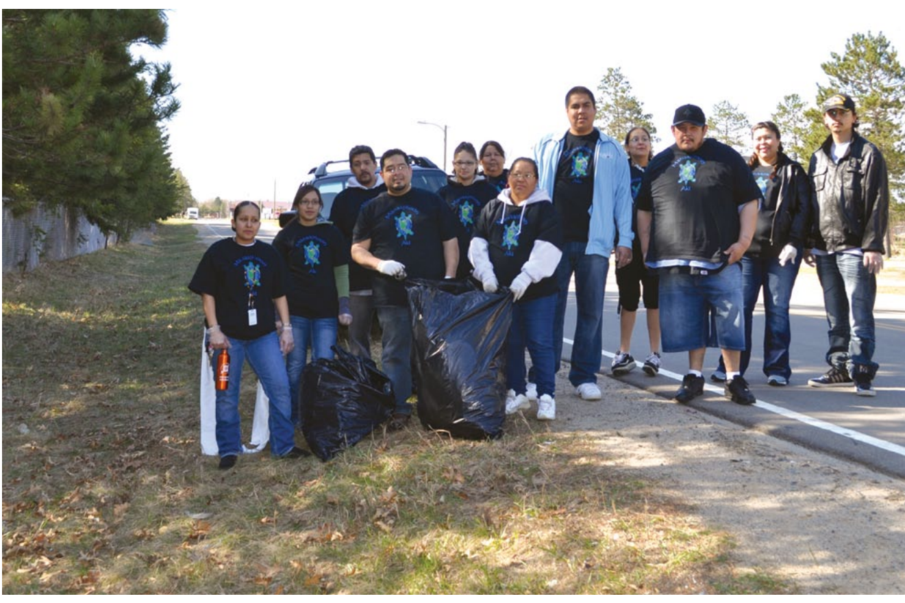
above Clean-up volunteers below Ditch in Track 33 before the Clean-up