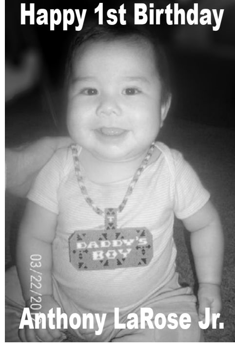
Love Dad & Mom

Paul Bunyan Dr NW Bemidji (Located next too Papa Murphy's) Appointment Necessary #444-3310 (If unavailable please leave msg. name & #)