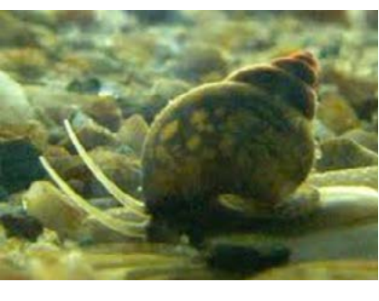
Invasive Species Above: Faucet snail Left: Zebra mussel