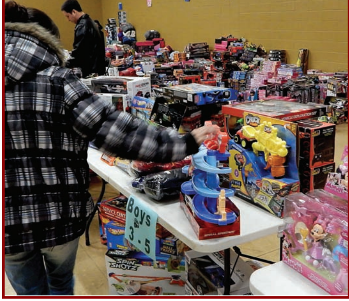
TOYS FOR TOTS-DISTRIBUTED TO EVERY DISTRICT CASS LAKE, SUGAR POINT, BALL CLUB