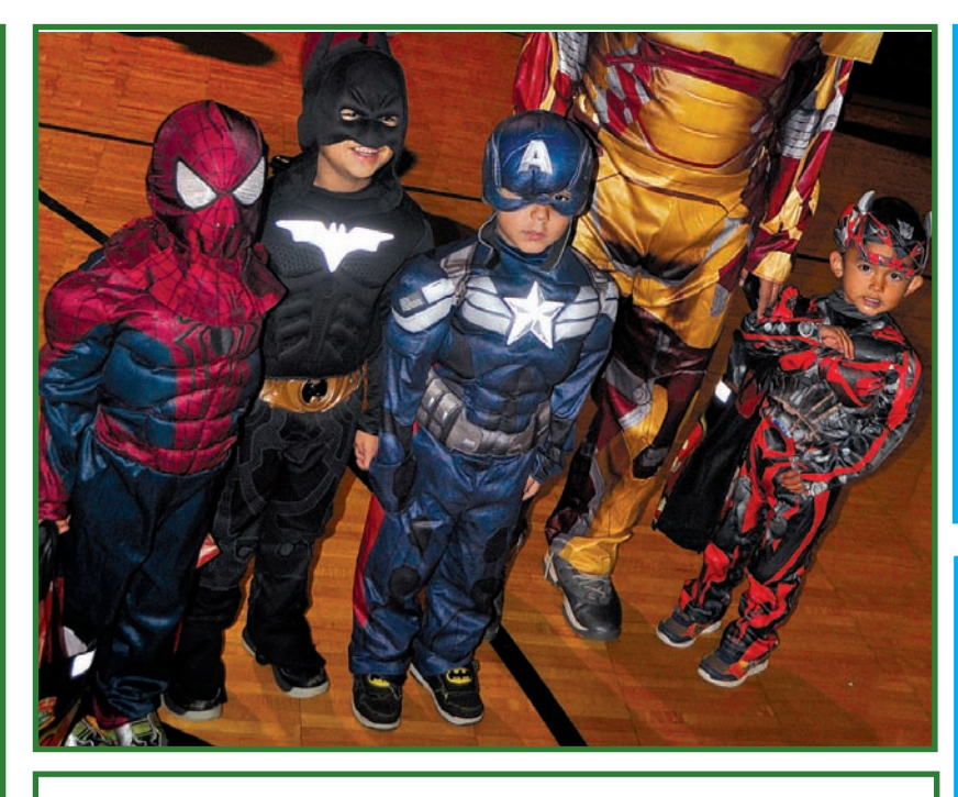
TREATS FOR TOTS BOYS & GIRLS CLUB OF CASS LAKE